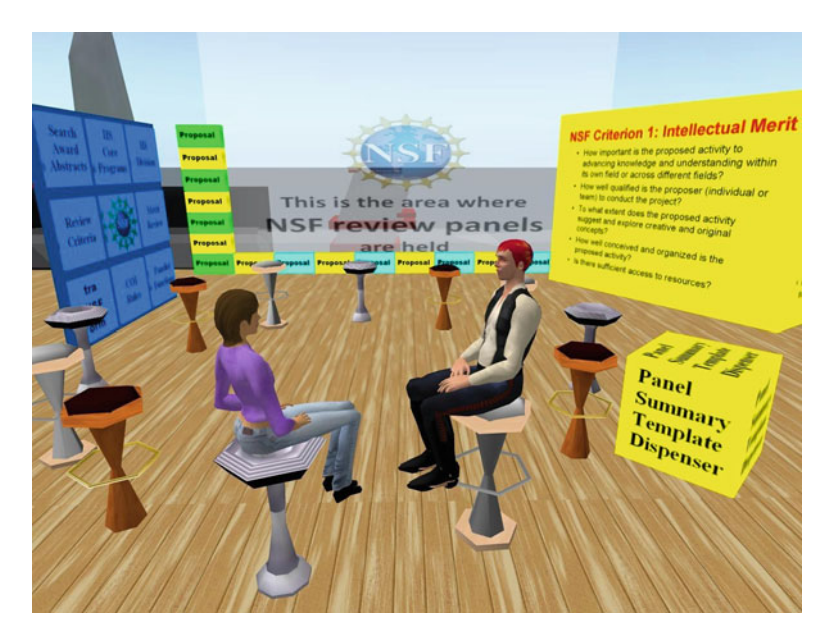
Fig. 2.1 One of the areas where virtual review panels are held by NSF